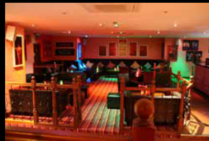
SPACIOUS, RELAXING AND COZY