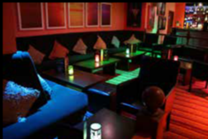
COMFORTABLE, EXCLUSIVE AND PRIVATE

DJ & ENTERTAINMENT PACKAGES AVAILABLE UPON REQUEST THE HAVANA BAR IS AVAILABLE FOR SMALL OR LARGE BUFFET PARTIES FROM 20 - 90 PERSONS. PLEASE ASK TO SEE OUR ROOM ABOVE ARRIBAS.